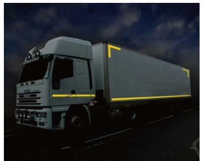
Application examples for ORALITE® VC 104+.