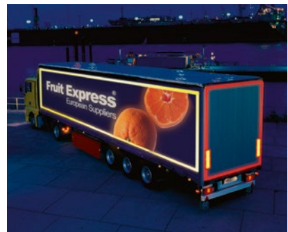
Application examples for ORALITE® VC 104+.